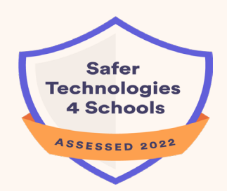
Don't morph the badge - ensure proportions are kept intact.